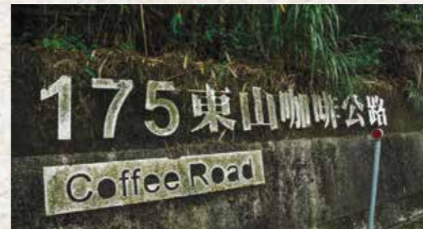
Dongshan 175 Coffee Road