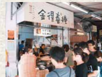
Kintoku Spring Rolls