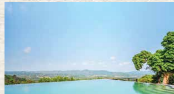
Fairy Lake Leisure Farm