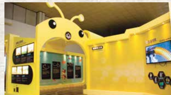
Tung-ho Bee Culture Tourism Factory