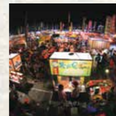
HuaYuan Night Market