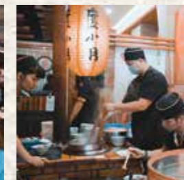
Du Hsiao Yueh Ta-a Noodles