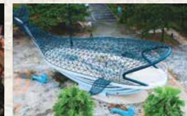
Whale Wishes Sculpture